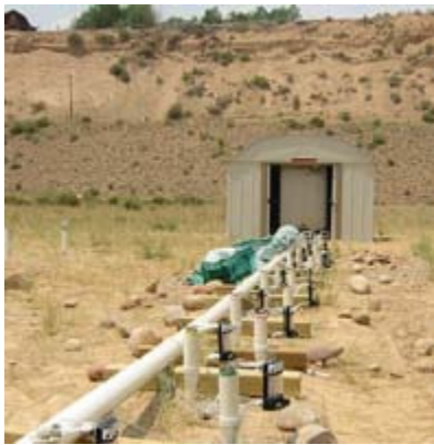
Wells at old Rifle mine inject acetate (vinegar) into the ground to stimulate the growth of microbes already in the soil.

During the Cold War, the United States produced uranium for its nuclear weapons at Rifle Mill in Western Colorado. The mine closed in 1972, but the uranium has caused lasting effects on the area, despite clean-up efforts. Uranium remains underground today, and radioactive metal from the site is still contaminating groundwater that eventually flows into the Colorado River.